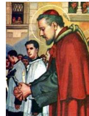
November 4 Patron of Seminarians and Catechists

Oh God, Maintain in your people that spirit with which you inspired your Bishop St. Charles, so that your church may be constantly renewed, conforming itself to Christ and manifesting Christ to the world.